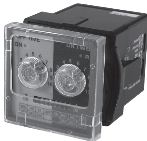
1/16 DIN Flip-Flop Timer